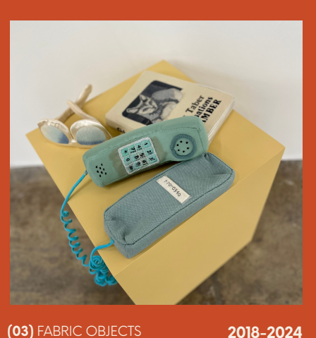
THE HAMMER MUSEUM 2018